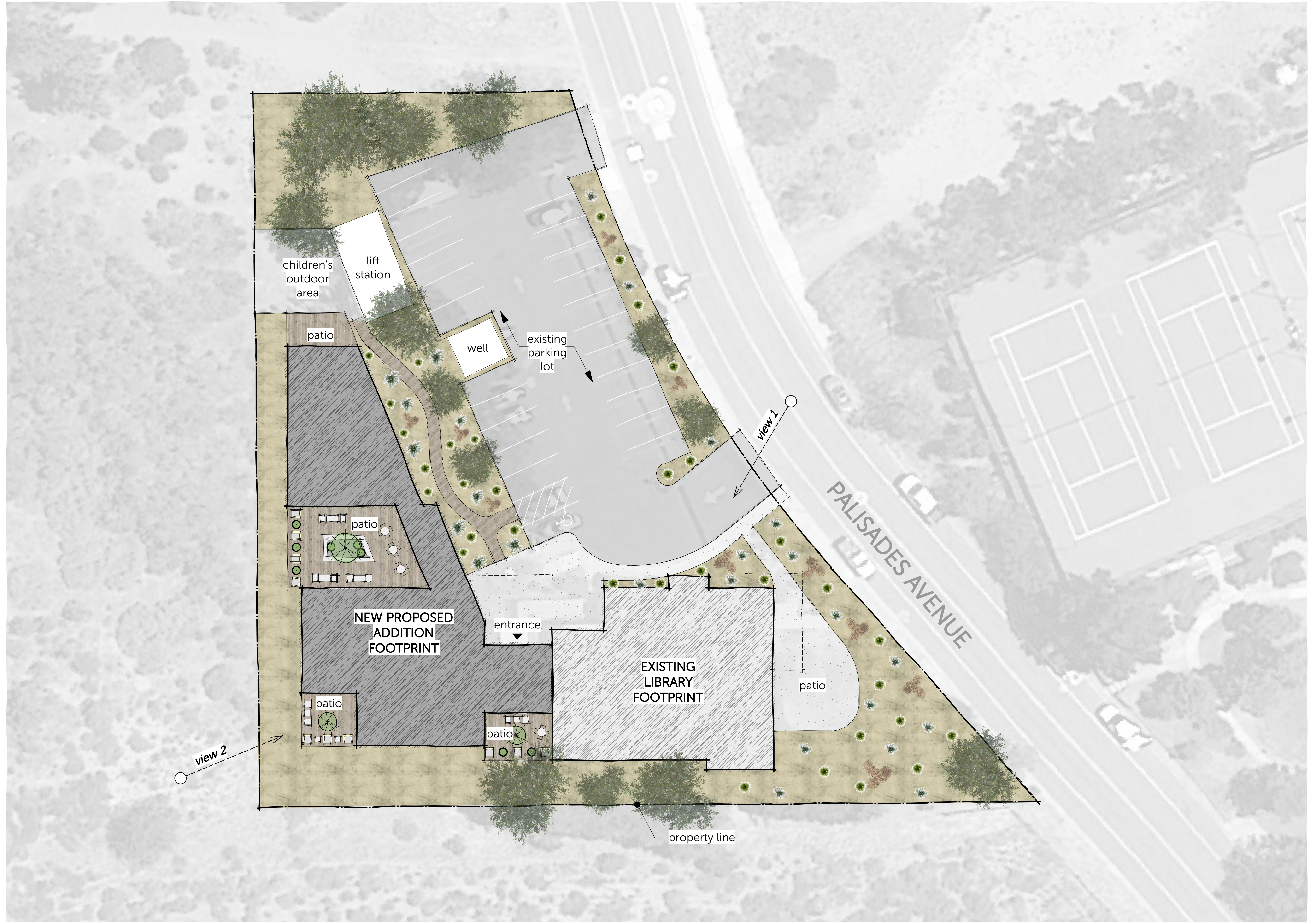
SITE PLAN Scale: 1/16" = 1'-0"